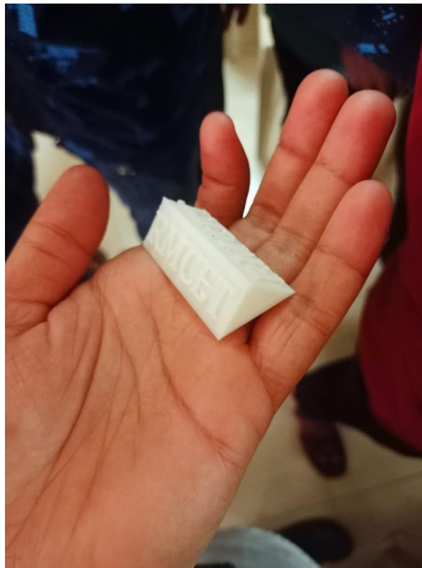
3D Printed final product